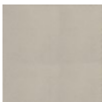
Body: 9146-83CC Leather