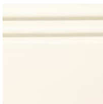
Wedding Dress White