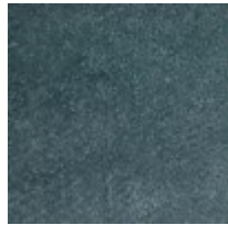
Pillow Fabric: 2-20" x 14" Pillows Front 8104-52CC, Front Ends 2153-52CC with Double Row of Trim U00415, Back 2285-52CC