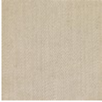
Body Fabric: 2321-87CC