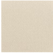
Body Fabric: 2461-34CC