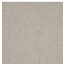
1-20" x 14" Pillow 3175- 13CC