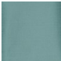
Body Fabric: 2609-33CC