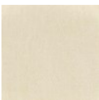
Body Fabric: 2195-34C