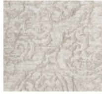
Pillow Fabric: 1- 24"x22" Fitted Back Cushion 5085-42CC