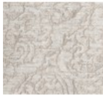
Pillow Fabric: 1-24"x22" Fitted Back Cushion 5085-42CC