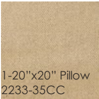
1-20"x20" Pillow 2233-35CC