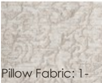
Pillow Fabric: 1-24"x22" Fitted Back Cushion 5085-42CC