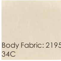
Body Fabric: 2195-34C