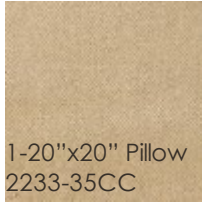
1-20"x20" Pillow 2233-35CC