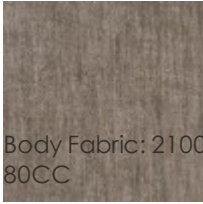
Body Fabric: 21008- 80CC