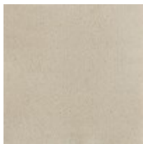
Pillow Fabric: 2-16\"/>