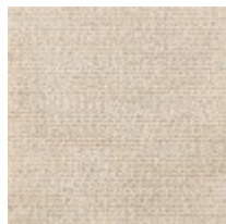
Body Fabric: 2637-34CC-P Performance