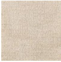
Body Fabric: 2637-34CC-P Performance