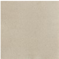
Pillow Fabric: 2-16"x18" back pillow 2681-34CC-P Performance with 2.5" box pleat.