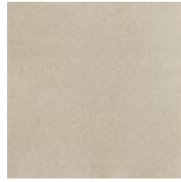
Pillow Fabric: 2-16"x18" pillow fabric 2681-34CC-P Performance with 2.5" box pleat.