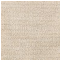
Body Fabric: 2637-34CC-P Performance, Back Cushion 2681-34CC-P