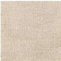
Body Fabric: 2637-34CC-P Performance, Back Cushion 2681-34CC-P