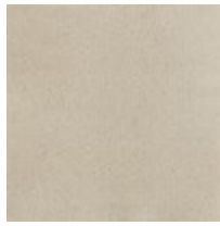
Pillow Fabric: 2-16"x18" back pillow 2681-34CC-P Performance with 2.5" box pleat.