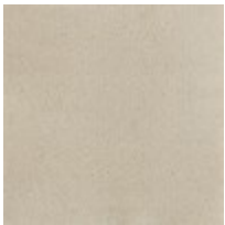
Pillow Fabric: 2-16"x19" back pillow 2681-34CC-P Performance with 2.5" box pleat