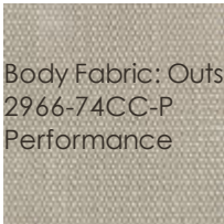
Body Fabric: Outside 2966-74CC-P Performance