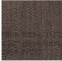
Flow fabric (1) 22" 22" flow fabric 22" flow fabric