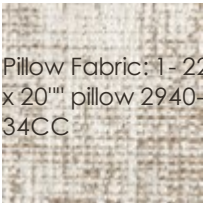
Pillow Fabric: 1 - 22''' x 20''' pillow 2940- 34CC