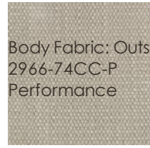
Body Fabric: Outside 2966-74CC-P Performance