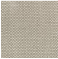
Body Fabric: Outside 2966-74CC-P Performance