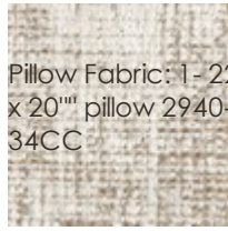
Pillow Fabric: 1 - 22''' x 20''' pillow 2940- 34CC