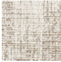
Pillow Fabric: 1- 22''' x 20''' pillow 2940- 34CC