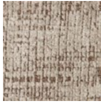
Pillow fabric: (1) 22" x 20" pillow fabric 2959-79CC