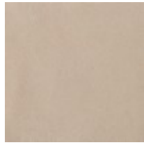
Top cushion 2633-88CC