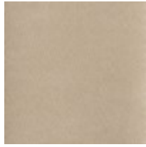
Top cushion 2633- 88CC