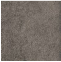
Seat Fabric: 2956- 53CC