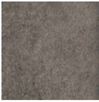
Seat Fabric: 2956-53CC