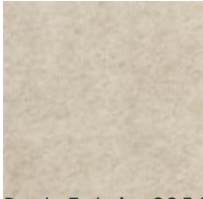
Body Fabric: 2956- 87CC