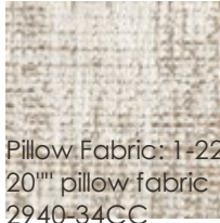
Pillow Fabric: 1-22" x 20" pillow fabric 2940-34CC