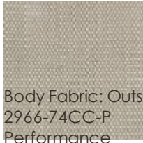
Body Fabric: Outside 2966-74CC-P Performance