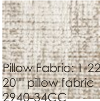
Pillow Fabric: 1-22''' x 20''' pillow fabric 2940-34CC