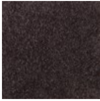
Body Fabric: Inside 2956-81CC