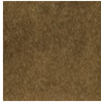
Pillow Fabric: (1) 22" x 20" pillow fabric 2956-80CC