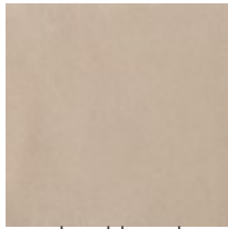
contrast border 2633-88CC