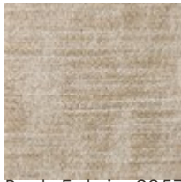
Body Fabric: 2957- 88CC-P Performance