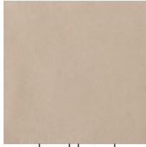
contrast border 2633-88CC