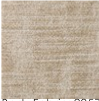
Body Fabric: 2957- 88CC-P Performance