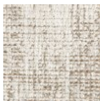
Pillow Fabric: 2- 22" x