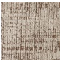
Pillow Fabric: (2) 22" x 20" pillow fabric