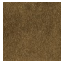
(1) 24" x 16" kidney pillow 2956-80CC