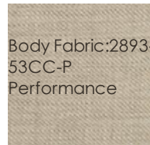
Body Fabric:2893-53CC-P Performance