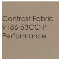
Contrast Fabric 9186-53CC-P Performance