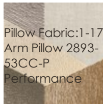
Pillow Fabric:1-17x29 Arm Pillow 2893-53CC-P Performance