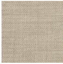
Body Fabric: 2893- 53CC-P Performance