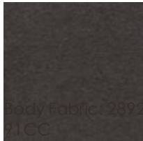
Body Fabric: 2892-71CC