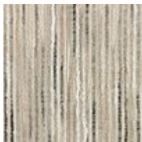
Body Fabric: 6128-77CC-P Performance,