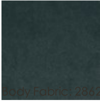
Body Fabric: 2862- 13CC