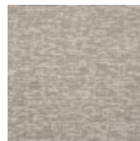
2-19" x 19" Pillows 3246-15CC