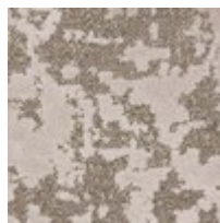
2-20" x 20" Pillows 4116-15CC