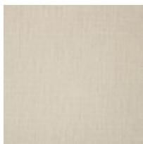
Body Fabric: 2829-88CC-P Performance