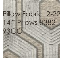
Pillow Fabric: 2-22" x 14" Pillows 8382- 93CC