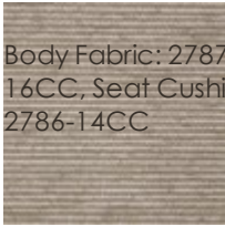
Body Fabric: 2787- 16CC, Seat Cushion 2786-14CC