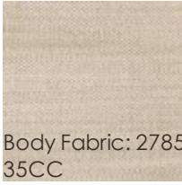
Body Fabric: 2785-35CC