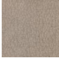
Outside Arm 3127- 71CC