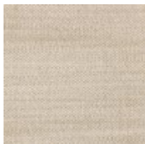
Body Fabric: 2785-35CC