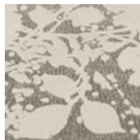
Pillow Fabric: 2-21" x 21" Pillows 5140-