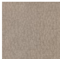
Outside Arm 3127-71CC