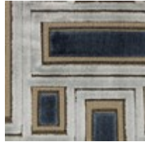
Pillow Fabric: 1-22''' x 18''' Back Pillow 8381-09CC