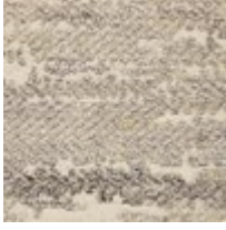
Body Fabric: 4112-87CC