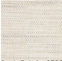
Body Fabric: 2702- 87CC-P Performance