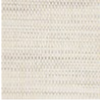
Body Fabric: 2702-87CC-P Performance