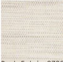
Body Fabric: 2702- 87CC-P Performance