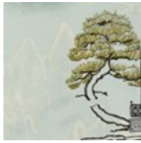
Seat and Back Cushion 8330-52CC