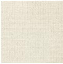
Body Fabric: 2694-88CC