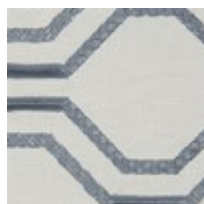
2-24''' x 16''' Pillows 8334-09CC