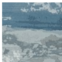
Pillow Fabric: 2-21''' x 21''' Pillows 8335-