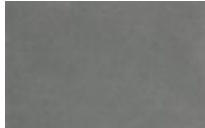
Body Fabric: 2595-93CC