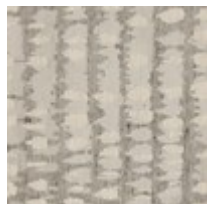
Pillow Fabric: 2-22" x 14" Pillows 8273-71CC