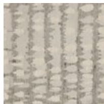
Pillow Fabric: 2-22" x 14" Pillows 8273-71CC