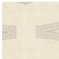
2-22" x 18" Pillows 8286-89CC