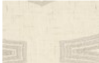
2-22" x 18" Pillows 8286- 89CC