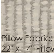
Pillow Fabric: 2- 22" x 14" Pillows 8273-71CC