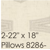
2-22" x 18" Pillows 8286- 89CC