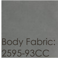
Body Fabric: 2595-93CC