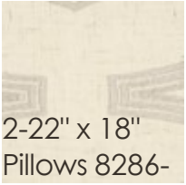
2-22" x 18" Pillows 8286- 89CC