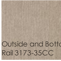
Outside and Bottom Rail 3173-35CC