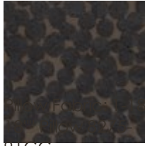
91CC " x