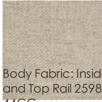
Body Fabric: Inside and Top Rail 2598- 44CC