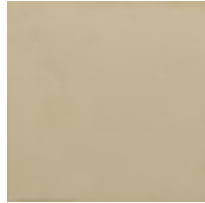
Whisper of Gold