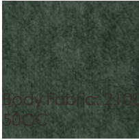
body fabric 21508- 60CC