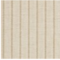
Body Fabric: 21009- 87CC