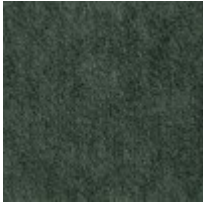
Body Fabric: 21008- 50CC