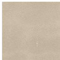
Ivory Painted Faux Shagreen