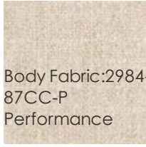
Body Fabric:2984- 87CC-P Performance