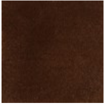
Body Fabric: 2681- 80CC