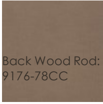
Back Wood Rod: 9176-78CC