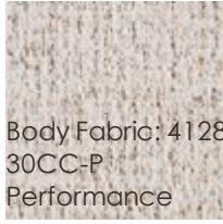
Body Fabric: 4128- 30CC-P Performance