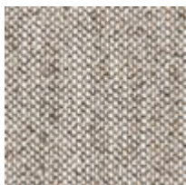
Body Fabric: 2999-