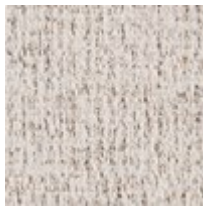
""Body Fabric: 4128-30CC-P Performance